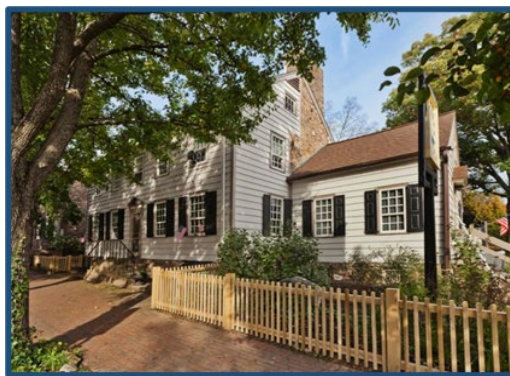
111 South State Street, Newtown PA 18940 Phone: 215.968.1820 Fax: 267.573.4602