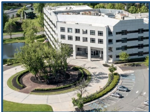
100 Overlook Center 2 nd Floor, Princeton NJ 08540 Phone: 609.336.3023 Fax: 267.573.4602

If you answered No or Not Sure to any of these questions, please consider scheduling a complimentary meeting with one of our professionals at no cost or obligation to you.