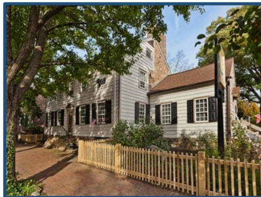
111 South State Street, Newtown PA 18940 Phone: 215.968.1820 Fax: 267.573.4602