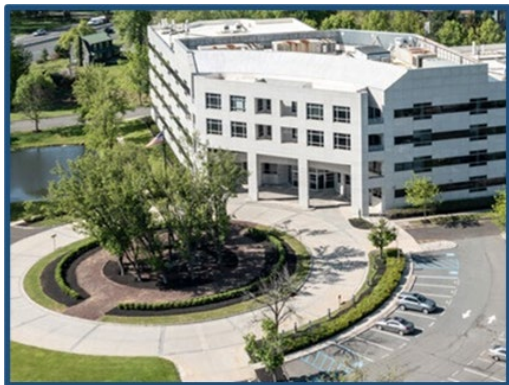
100 Overlook Center 2 nd Floor, Princeton NJ 08540 Phone: 609.336.3023 Fax: 267.573.4602

If you answered No or Not Sure to any of these questions, please consider scheduling a complimentary meeting with one of our professionals at no cost or obligation to you.