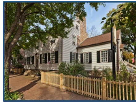
111 South State Street, Newtown PA 18940 Phone: 215.968.1820 Fax: 267.573.4602