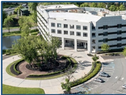
100 Overlook Center 2nd Floor, Princeton NJ 08540 Phone: 609.336.3023 Fax: 267.573.4602

If you answered No or Not Sure, please consider scheduling a complimentary meeting with one of our professionals.