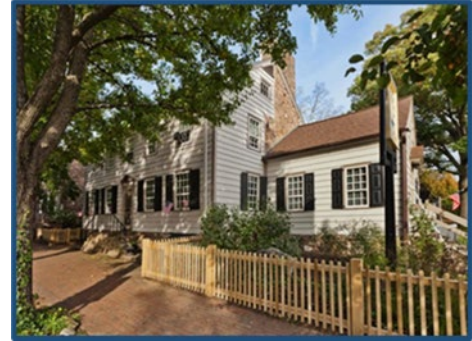
111 South State Street, Newtown PA 18940 Phone: 215.968.1820 Fax: 267.573.4602