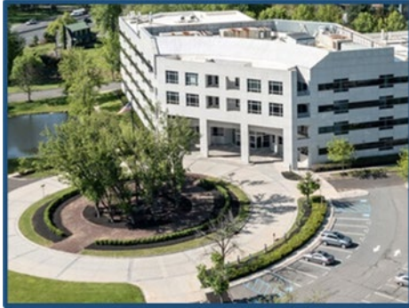
100 Overlook Center 2nd Floor, Princeton NJ 08540 Phone: 609.336.3023 Fax: 267.573.4602

If you answered No or Not Sure, please consider scheduling a complimentary meeting with one of our professionals.