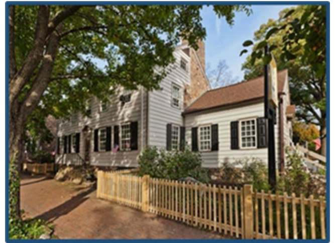
111 South State Street, Newtown PA 18940 Phone: 215.968.1820 Fax: 267.573.4602