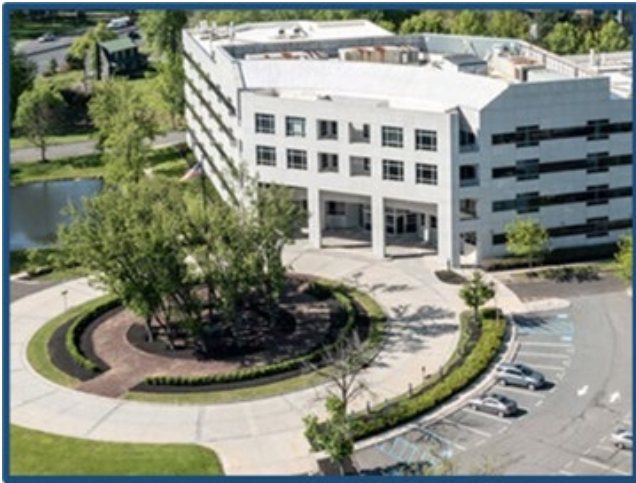
100 Overlook Center 2nd Floor, Princeton NJ 08540 Phone: 609.336.3023 Fax: 267.573.4602